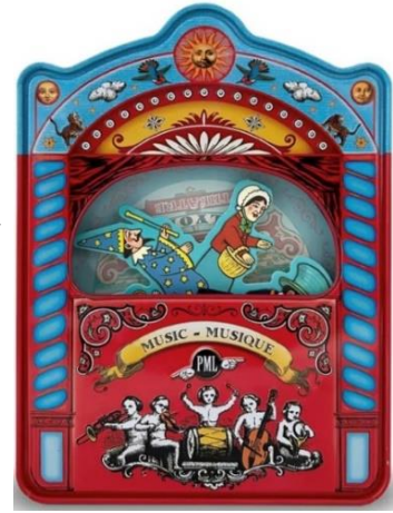
Image: a tin theatre. Tin music box with rotating, cardboard puppet theatre figures. The background - with a fantasy landscape - turns anti-clockwise. Melody: 'La vie en rose' by Edith Piaf. Collection: Dutch Puppetry Museum.

See among others: https://www.youtube.com/shorts/n70jtsG5rJ4 .